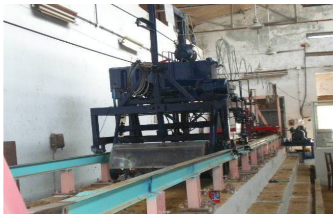
Fig. 1 : Experimental soil bin